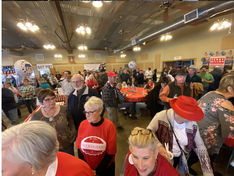
Attended the Burnet County Chili Cook Off