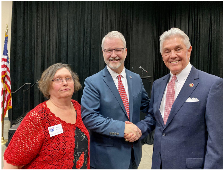
Celebrated Presidents Day with Congressman Roger Williams at the Johnson County Republican Party.