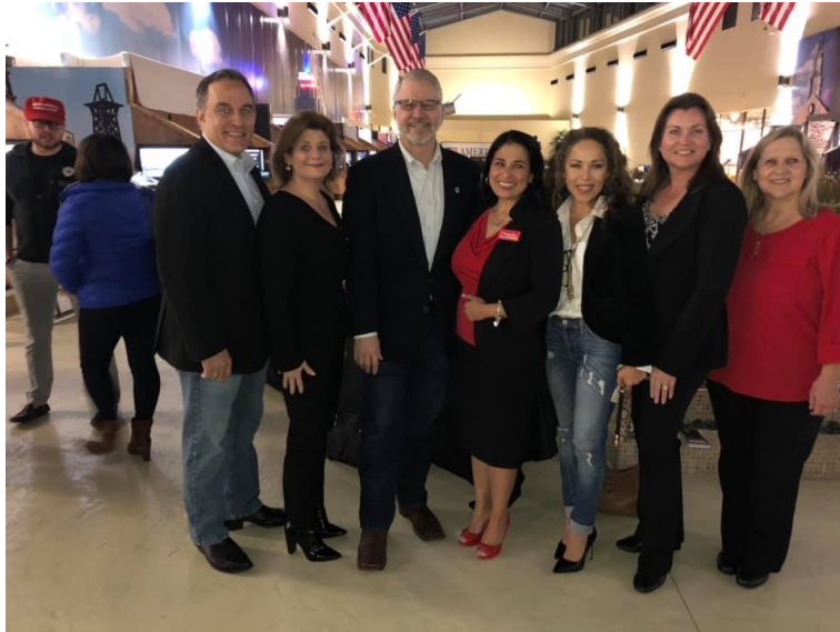
Spoke at the Greater Katy Area Republicans "Get Out the Vote" rally. It's exciting to see Republicans across the state getting fired up to head to the polls in 2020.