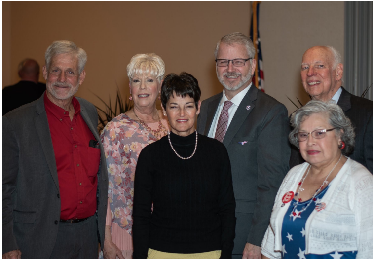
Attended the Guadalupe county Lincoln Day Dinner.