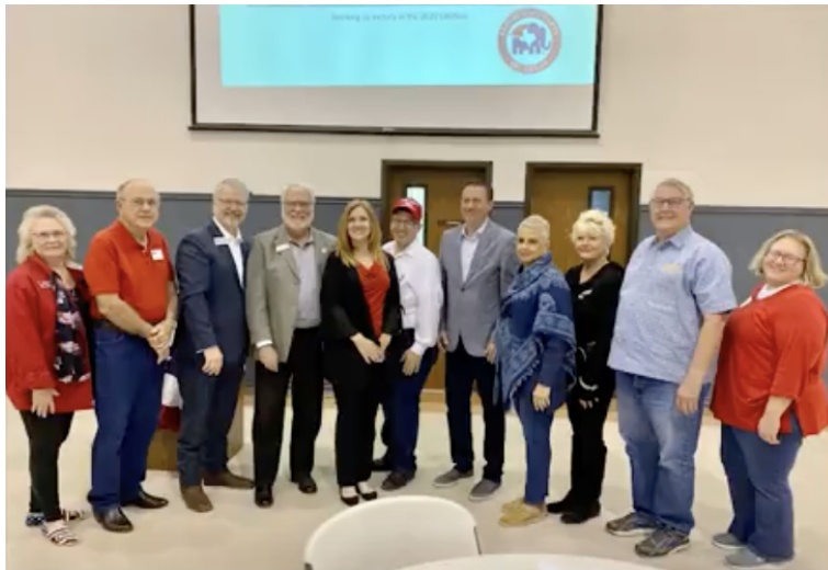
Traveled to Gonzales county - home of the Gonzales flag and immortal "Come and Take It" message - where I spoke at a Senate District 18 training event on how we will keep Texas red in 2020.