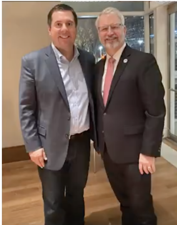
Attended a reception in Dallas with California Congressman Devin Nunes. It's always great to visit with Republicans across the country.